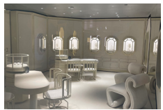
Licence info - Quinine Source - Quinine